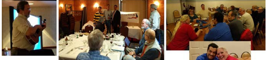
We celebrated change we rejoiced with old friends, and we looked forward together.